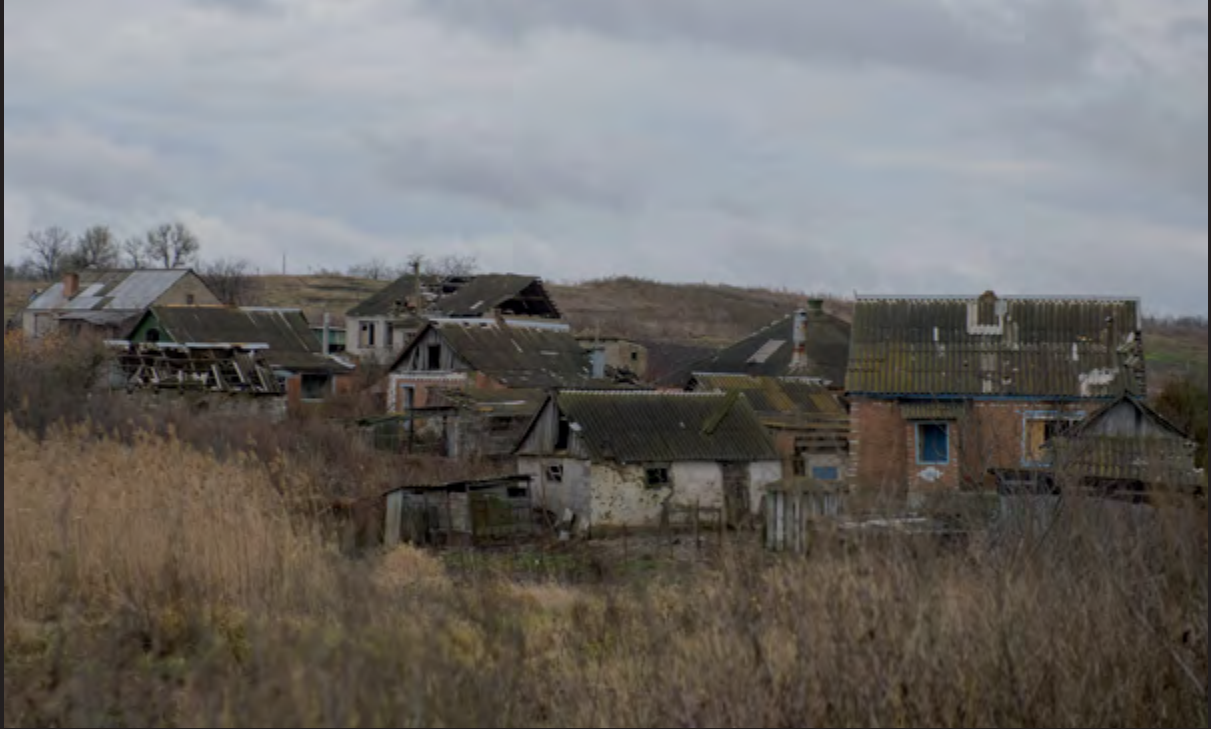
👁️ ↑ Mala Komyshevakha, the sisters' home village in Ukraine's eastern Kharkiv region, which was almost totally destroyed during Russia's full-scale invasion.