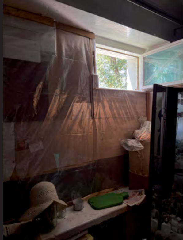
☞ ↑ Tetiana Hrebenyuk-Huzenko, 72, looks out of the boarded-up windows of her home in Iziium, Ukraine.