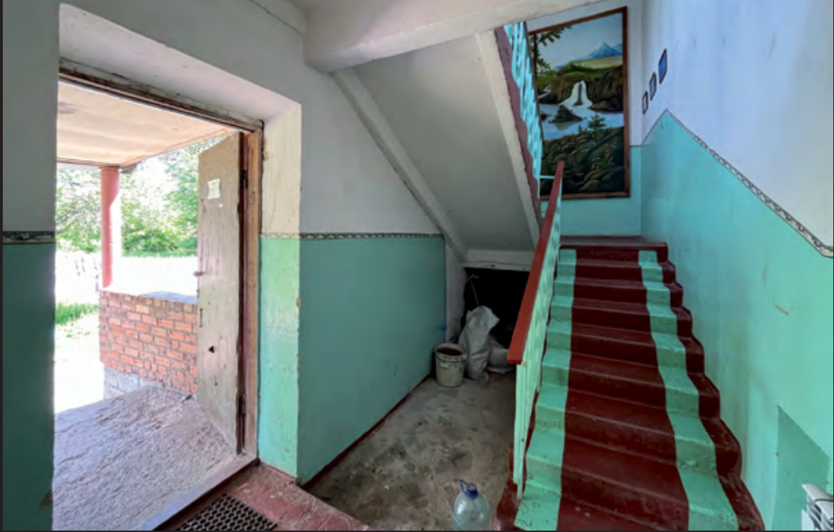
↑ A temporary shelter for displaced people in Kharkiv, Ukraine. Many shelters are physically inaccessible to people with disabilities, lacking ramps or grab bars.