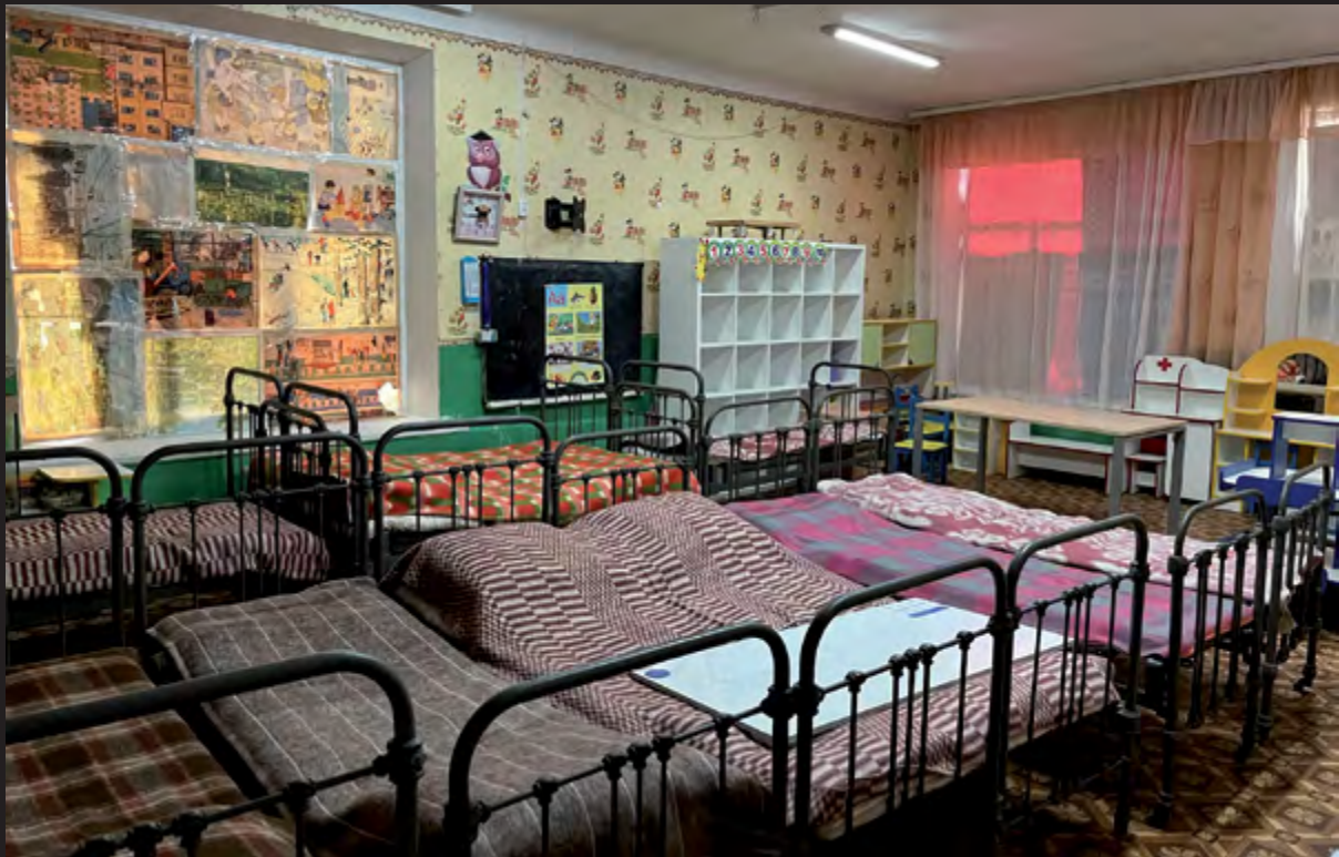
👁️ ↑ A nursery school that has been adapted into a shelter for displaced people in Kharkiv region, Ukraine.