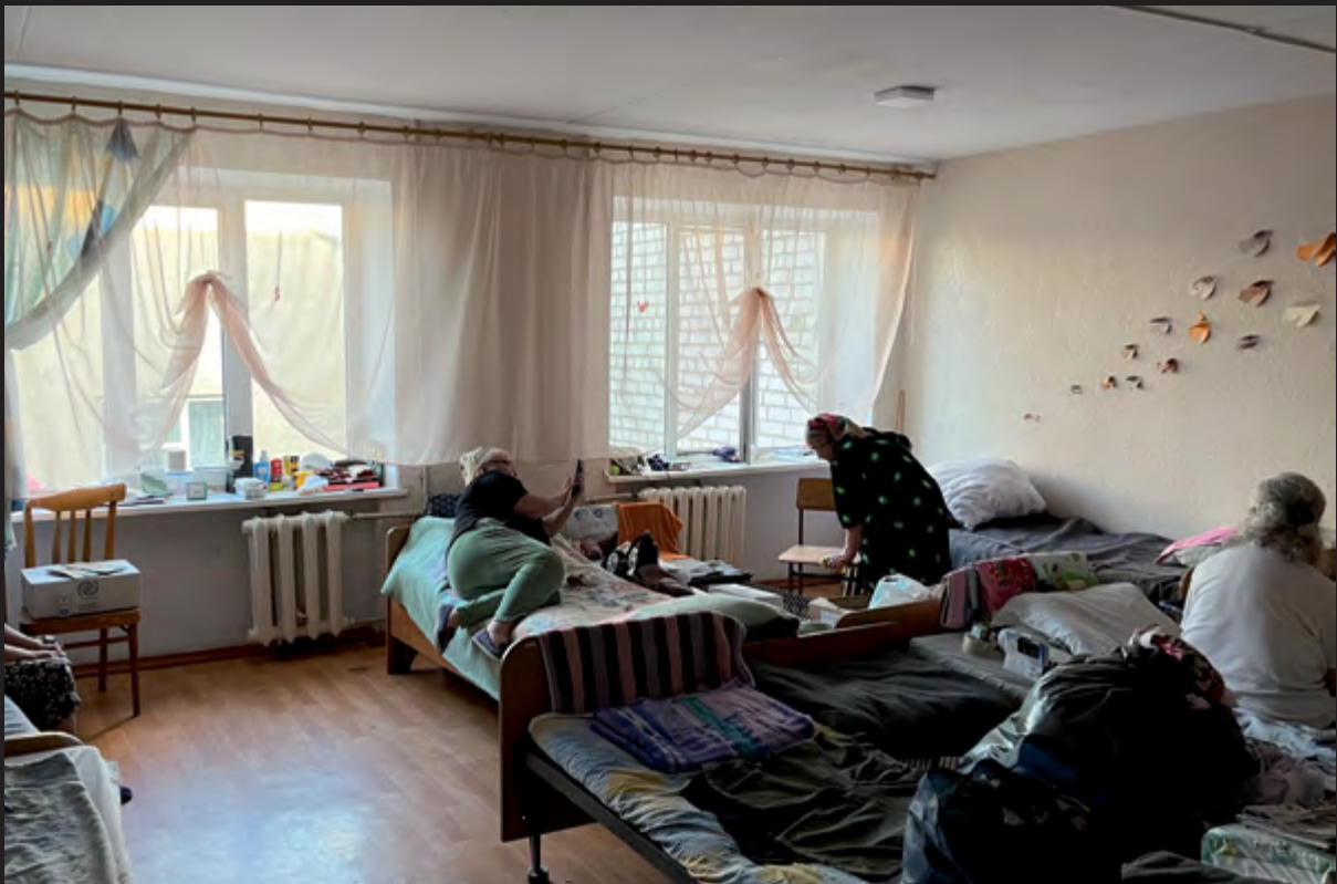
↑ A school that has been adapted into a shelter for displaced people in Mykolaiv, Ukraine. 80% of the residents of the shelter are older people, and many have disabilities.