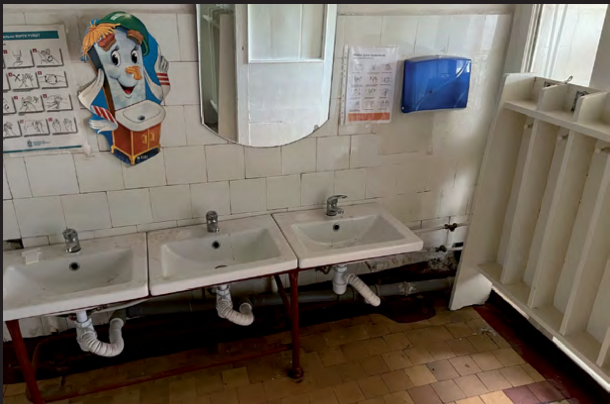
👁️ ↑ A bathroom facility in a temporary shelters for displaced people in Kharkiv, Ukraine. Shelters, which are often in schools or nurseries, often do not have physically accessible sanitation for people with disabilities.